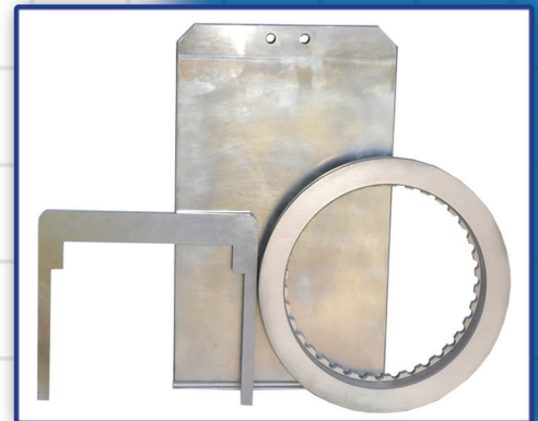
Factory replaceable - hardened gate, cartridge and guide for extremely abrasive conditions