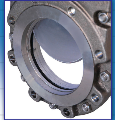
Full port, perimeter seat