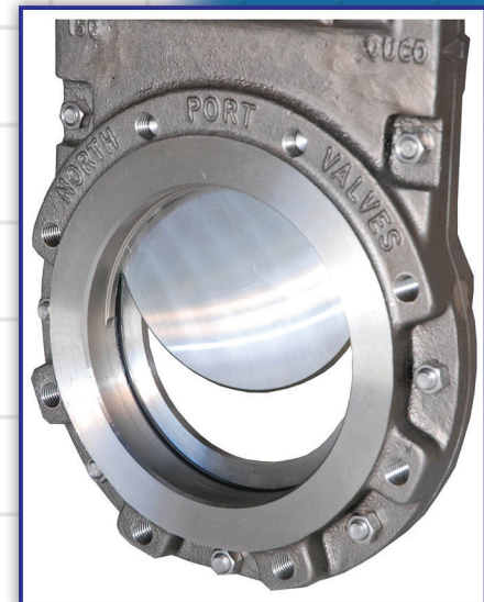
Outlet side with Cone Deflector